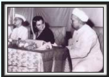
Smt. Indira Gandhi Prime Minister of India