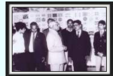
Shri R. Venkataraman Vice-President of India