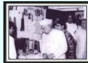
Shri C.P.N. Singh Governor of UP