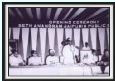
Shri Hemwati Nandan Bahuguna Chief Minister of UP