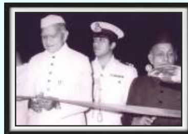
Dr. Fakhruddin Ali Ahmed President of India